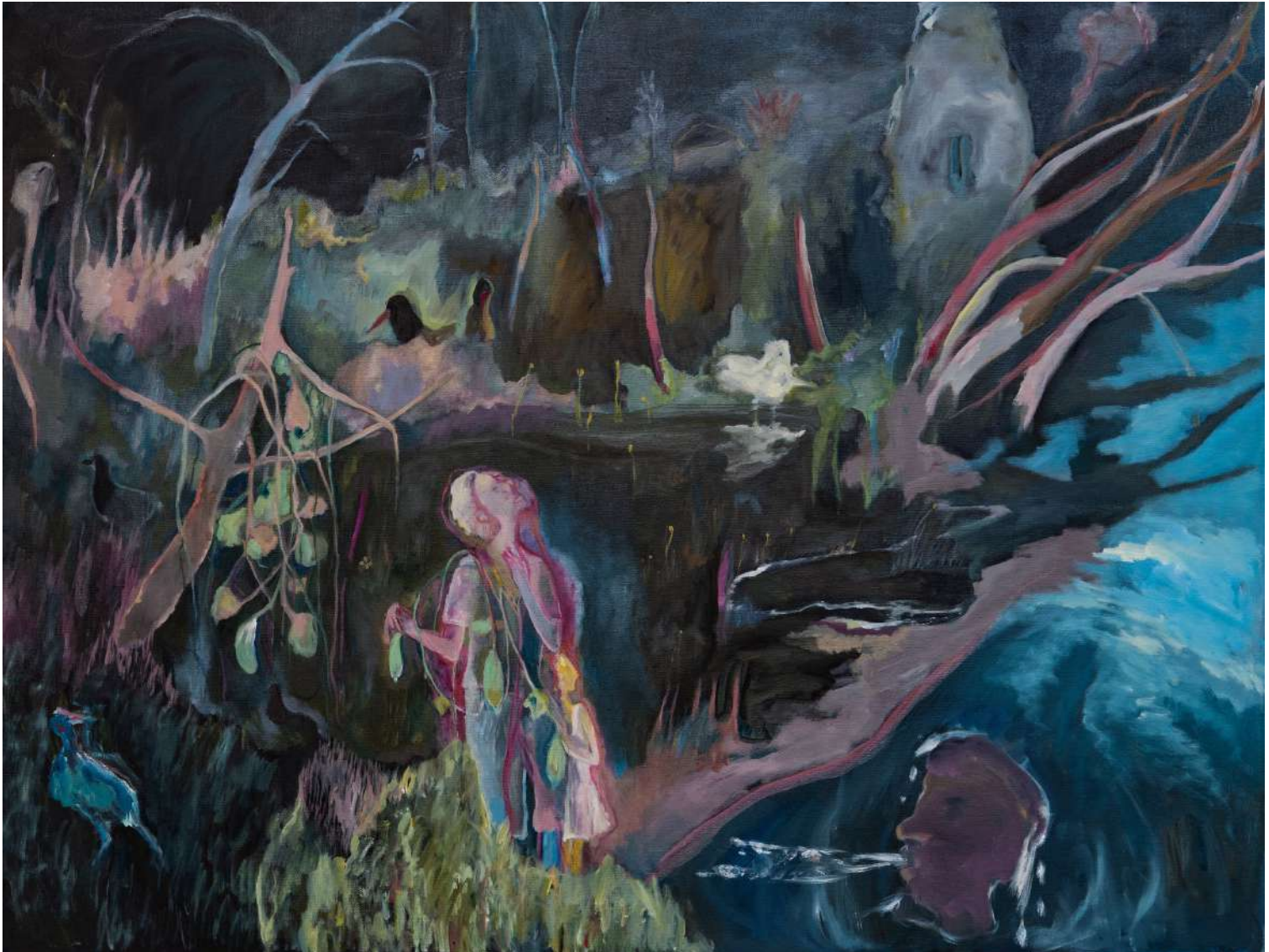
Luffa Gatherers 2021 Oil on canvas 36 x 48 in / 91.4 cm x 122 cm