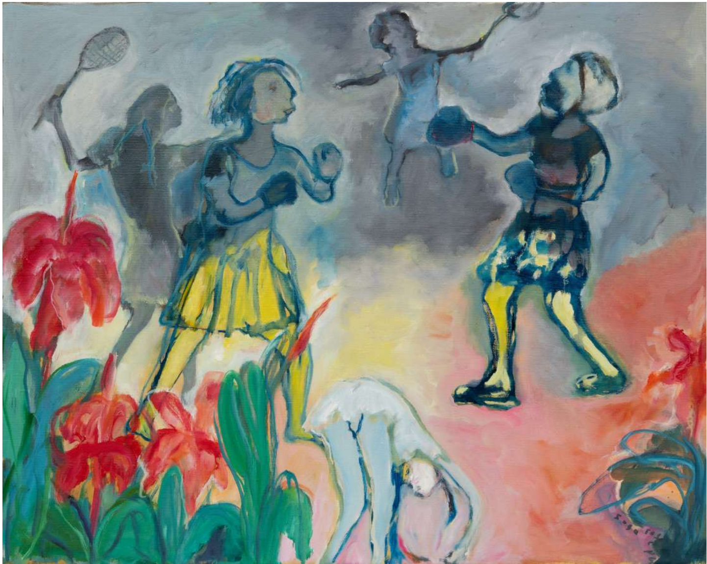
Street Boxers 2019 Oil on canvas 24 x 30 in / 60.9 x 76.2 cm