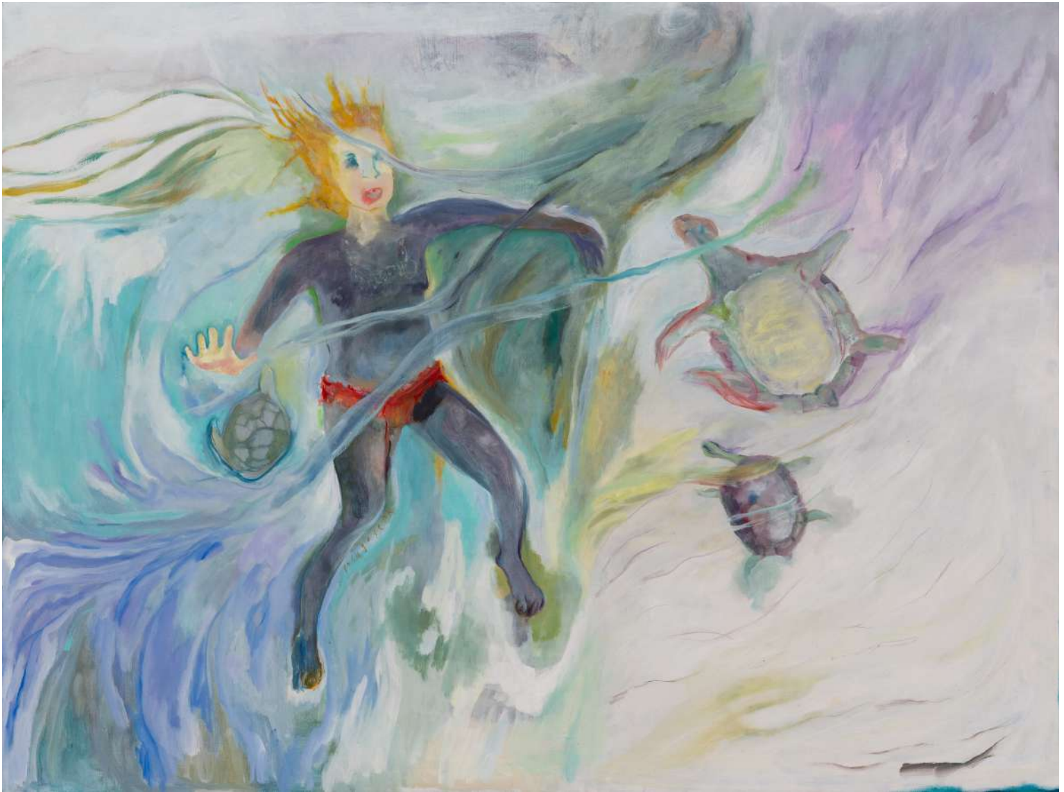
Turtle Watcher 2021 Oil on canvas 36 x 48 in / 91.4 cm x 122 cm