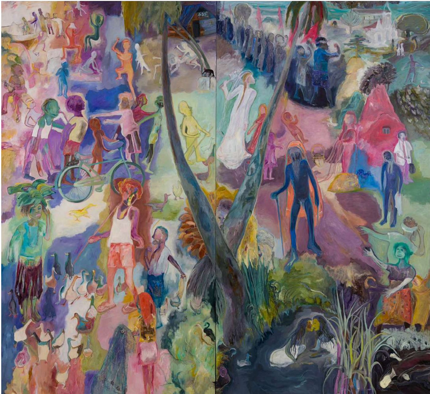
Duck Farmers 2019-21 Oil on canvas 108 x 118 in / 274.3 x 299.7 cm