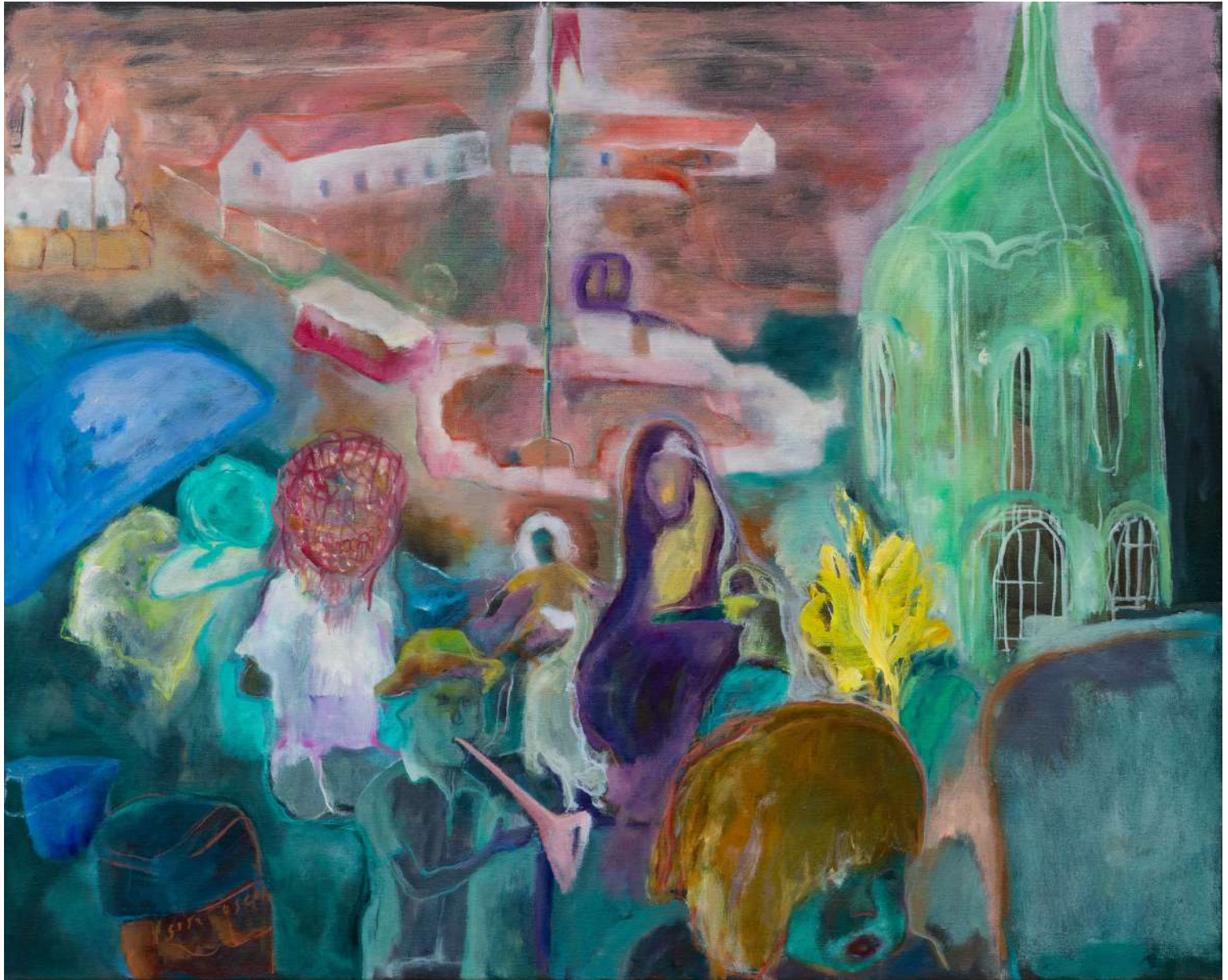
Feasters 2021 Oil on canvas 24 x 30 in / 60.9 x 76.2 cm