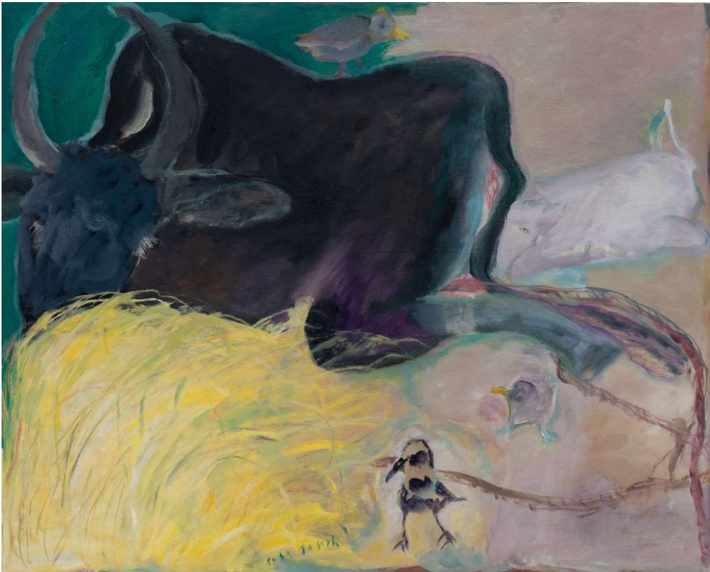
Stable Visitors 2019-21 Oil on canvas 24 x 30 in / 60.9 x 76.2 cm