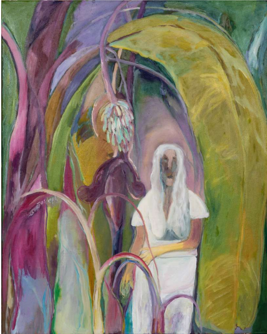
Grandmother and the Banana Flower 2019 Oil on canvas 30 x 24 in / 76.2 x 60.9 cm