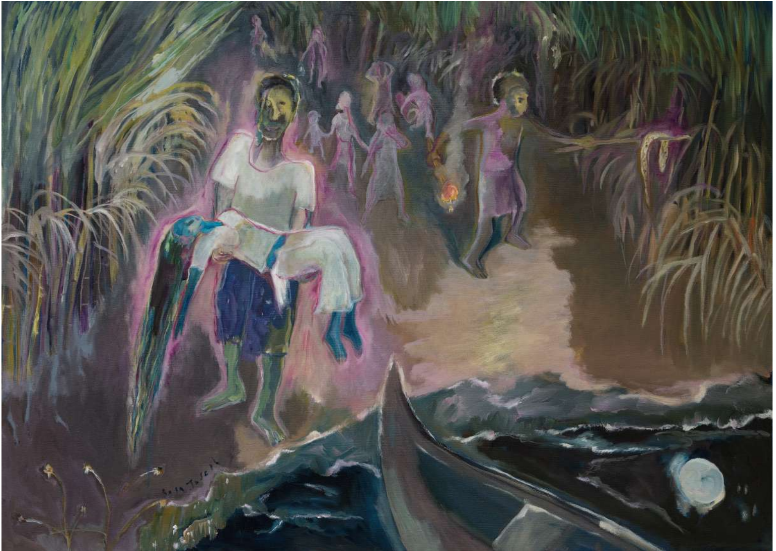
A Viper in the Sugar Cane Field 2021 Oil on canvas 36 x 48 in / 91.4 cm x 122 cm