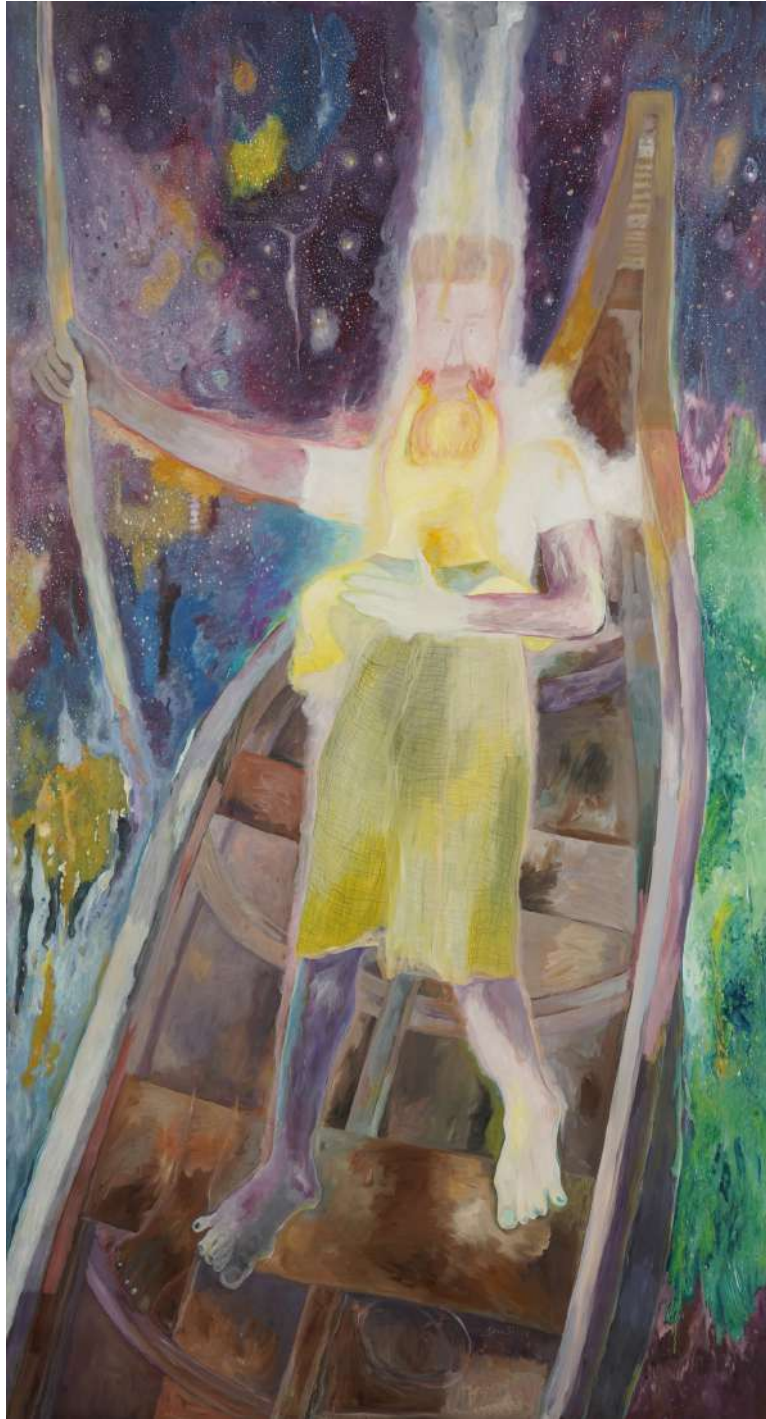
The Ferryman and his Jaundiced Child 2019 Oil on canvas 107.2 x 57.8 in / 272.5 x 147 cm