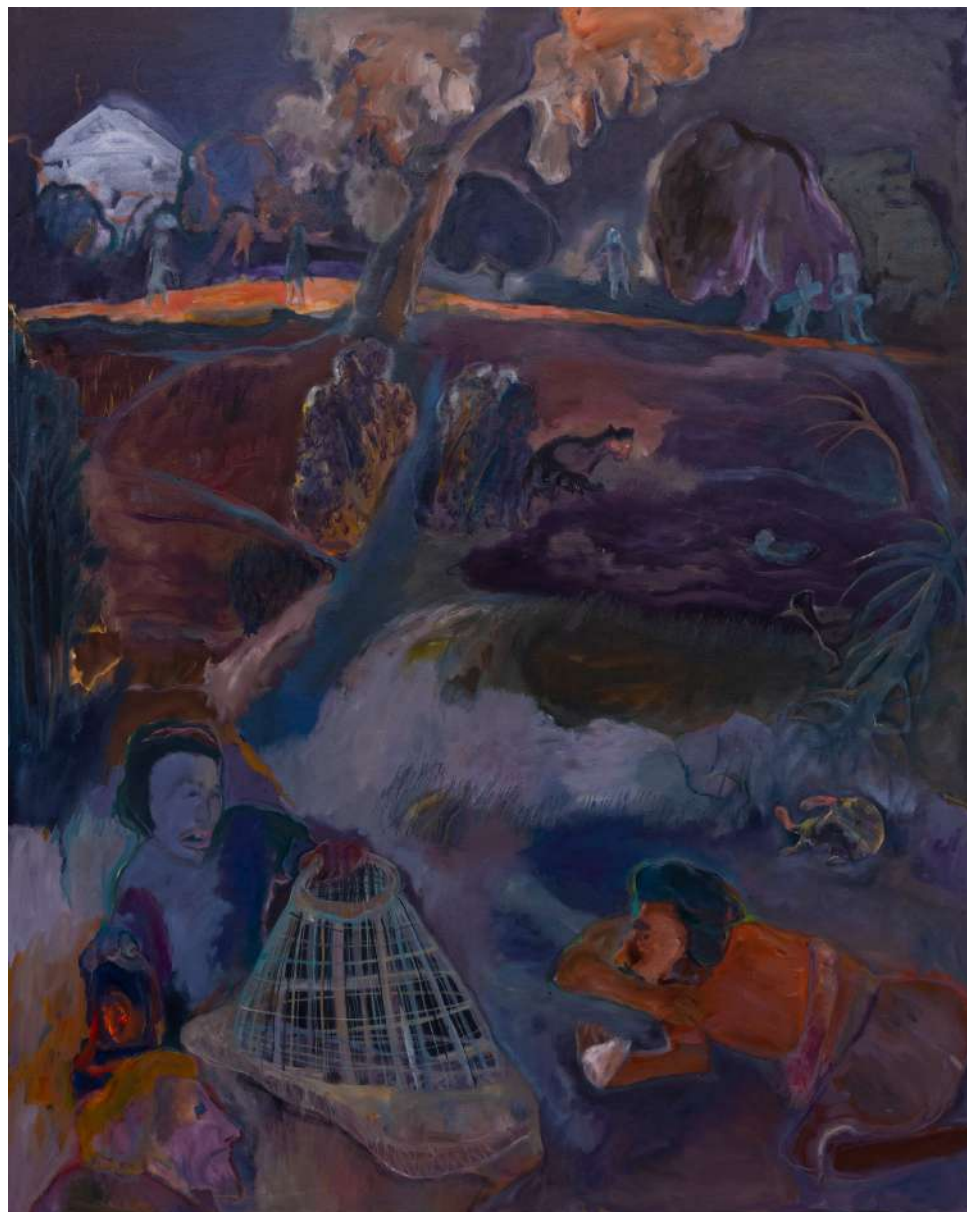
Frog Hunters 2021 Oil on canvas 60 x 48 in / 152.4 x 121.9 cm