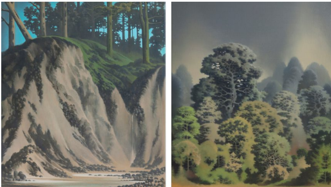
(Right) Aji V.N., Untitled , 2017, 80×60 cm, oil on canvas; (Left) Aji V.N., Untitled , 2017, 80×60 cm, oil on canvas