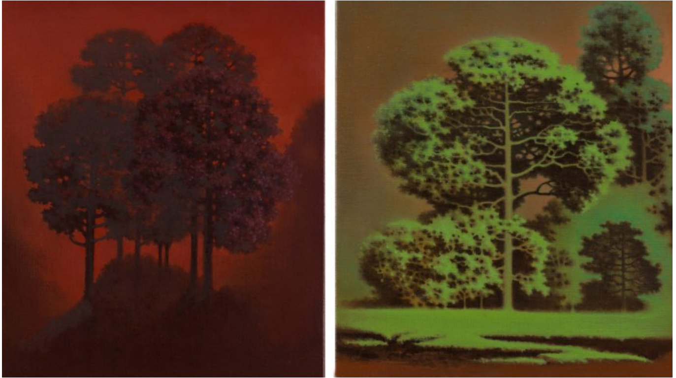
(Right) Aji V.N., Untitled , 2017, 40×30 cm, oil on canvas; (Left) Aji V.N., Untitled , 2014, 40×30 cm, oil on canvas.

At first you don't think you are looking at oils: fleshy greens, terracotta browns and crimson tide hues seem washed by an incandescent aura. He gives a rocky pathway distant geographical naturality and backs the tree with a limpid sunset; uncanny how the haze of colour turns parts of landscapes ghostly and makes you wonder if you are looking at a wash and not an oil (painting).