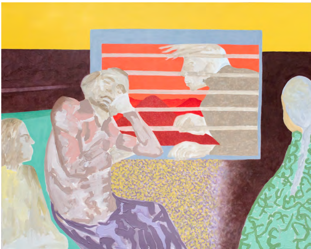
'Footboard Rider', 2016, acrylic on canvas, by Gieve Patel.

Patel's paintings and poetry dance between the profound and the profane, but his demeanour is gentle and unassuming. We sit in a room that doesn't give away much. There is an empty easel, a few cushions and chairs to sit upon and some books. The 76-year-old Patel is not as reticent. He speaks in evenly-measured tones that occasionally have hints of laughter. He could be talking about science-fiction or reality or the space connecting the two. But always, there is a twinkle behind his gaze.